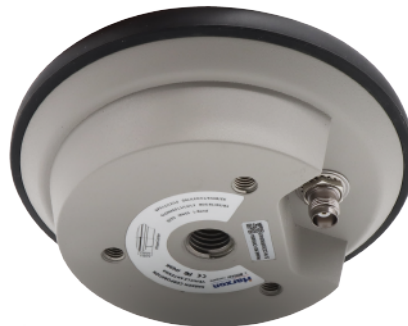
Downward TNC-K Connector

Undeclared Tolerance: \pm 0.3 \text{ mm}